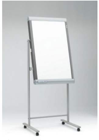
shown in vertical position