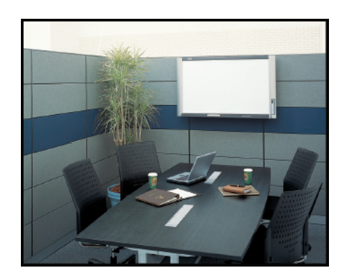
PLUS copyboards are wall mountable (except BF-035), cubicle mountable (M-5 only, with cubicle mount kit), as well as free standing (with optional stand).